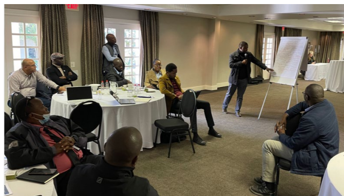
Discussions at the Practical Perspectives dialogue in South Africa

In the run-up to COP27 we will continue to amplify farmer voices and support them to take part in the policymaking process. Following our successful Practical Perspectives event in Johannesburg, we look forward to bringing together farmers, farmer organizations, civil societies and others at our next dialogue in Rabat, Morocco on 26–27 September in partnership with the National Institute for Agricultural Research (INRA), Morocco . We'll use the insights and key findings from the dialogues to create a brief for policymakers ahead of COP27.