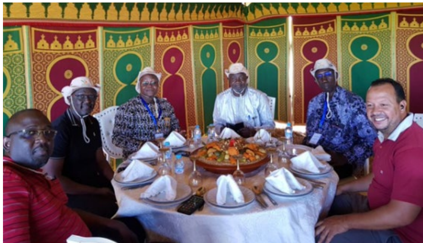
Participants at our Morocco dialogue enjoying a delicious local couscous dish.

A key insight drawn from the dialogue includes a clear call for policymakers to listen to farmers' organisations, including those representing women and youth, ensuring that they fully participate in all aspects of food systems development. The group also highlighted that public support for agriculture should be based on research and innovation that includes all stakeholders, building evidence-based, sustainable food systems that have positive impacts for people, nature and climate.